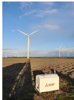
Fig 2: Compact lidar for wind monitoring