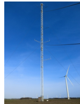
Fig 3: Meteorological mast

Meteorological masts, which are used conventionally to assess local wind prior to constructing a wind farm, only measure wind at fixed points. Also, the growing size of commercial turbines is requiring increasingly taller masts, which is contributing to higher construction costs for meteorological masts.