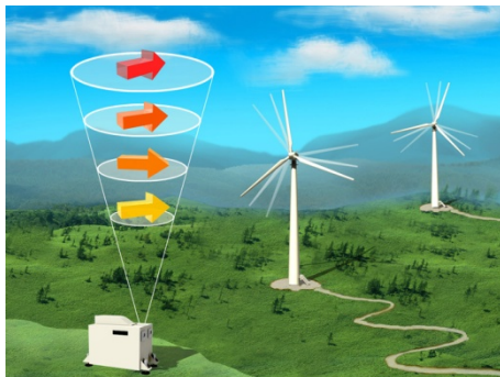
Fig 1: Rendition of lidar in the Field

TOKYO, May 28, 2014 – Mitsubishi Electric Corporation (TOKYO: 6503) announced today that the Energy research Centre of the Netherlands (ECN) has conducted tests to validate and subsequently approve Mitsubishi Electric's compact wind lidar as complying with European wind measurement standards. The lidar (portmanteau of "light" and "radar") is a remote sensing apparatus that projects a laser beam and then evaluates the reflected light to measure wind speed.